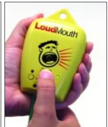
With the unit "ON". The green light should be lit.